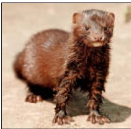
BUMMED OUT: Invader